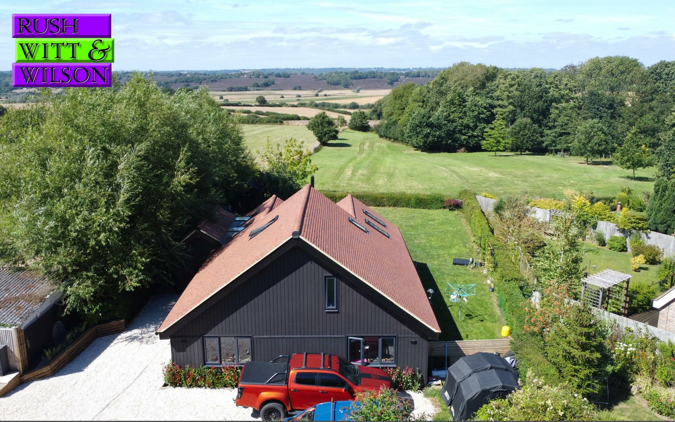
New Barn, Station Road, Northiam, East Sussex, TN31 6QL. Guide Price £675,000 Freehold